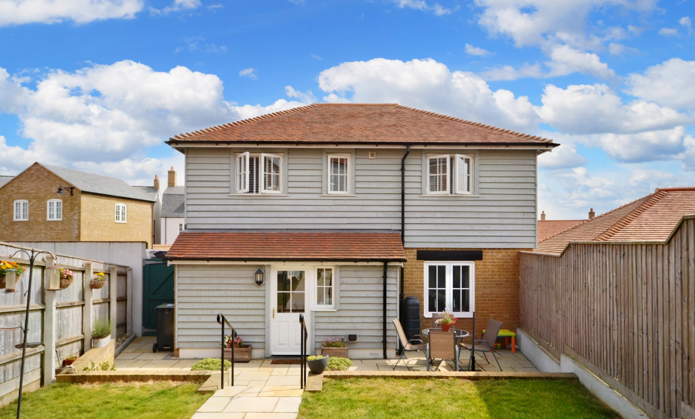
Secret House, Dugdale Mews Poundbury